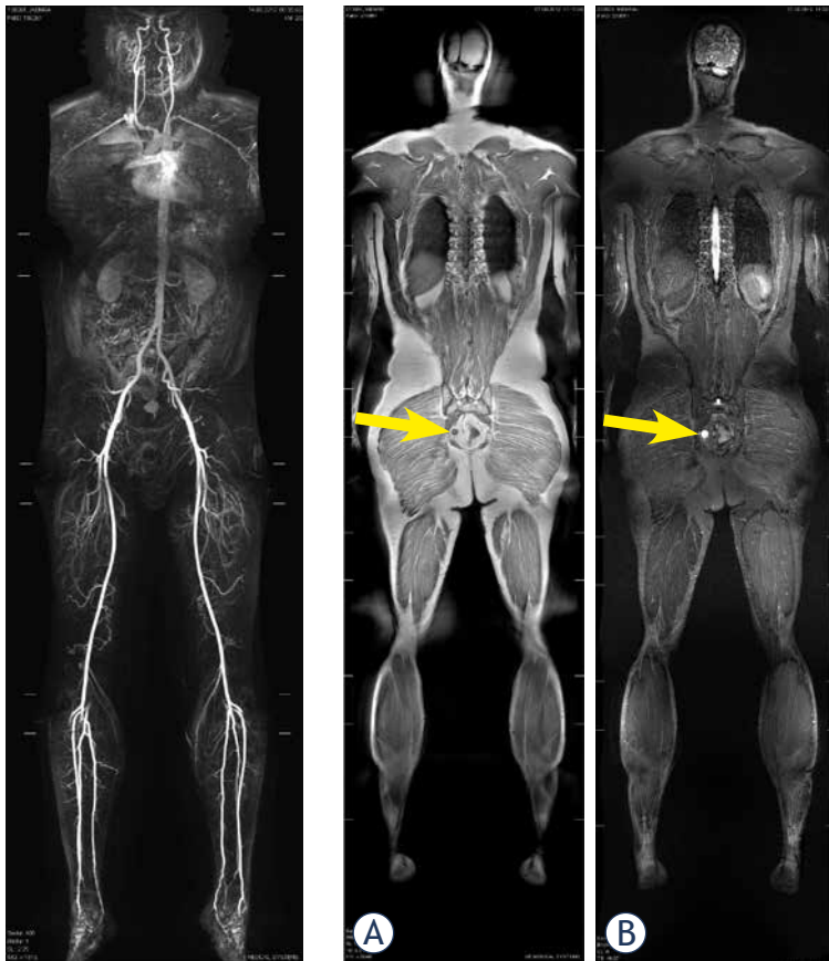
FIGURE 3. Whole-body MRA acquired on a dedicated whole-body MRI system and matrix coils with a single injection of contrast agent in an asymptomatic male 52-year-old patient, coronal reconstruction, pasted image.