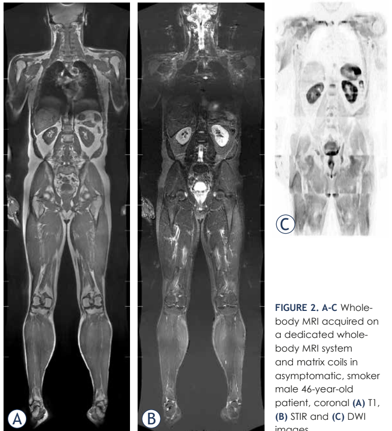
FIGURE 2. A-C Whole-body MRI acquired on a dedicated whole-body MRI system and matrix coils in asymptomatic, smoker male 46-year-old patient, coronal (A) T1, (B) STIR and (C) DWI images.