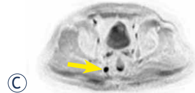
FIGURE 4. A-C Whole-body MR image of a 52-year-old male patient with history of sleep disorder, night sweats, hypercholesterinaemia and previous smoking. Note the right pararectal 16x14 mm mass (arrows) on the coronal (A) T1 (hypointense signal) and (B) STIR images (hyperintense signal); (C) diffusion weighted (DWI) axial image indicating a restricted diffusion. Inverted DWI image is similar to a PET image.

coils allowed for parallel imaging which speeded up the data acquisition.