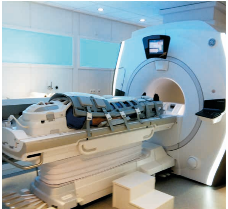
FIGURE 1. Whole-body MRI set-up of coils (head, chest, abdomen and extremity coils) in a wide bore magnet device.